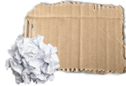
FOOD SOILED PAPER & CARDBOARD