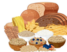
BREAD, PASTA, RICE, GRAINS, & COFFEE GROUNDS

PET WASTE PLASTIC BAGS SERVEWARE/UTENSILS PLASTIC CONTAINERS FOAM CONTAINERS HAZARDOUS WASTE